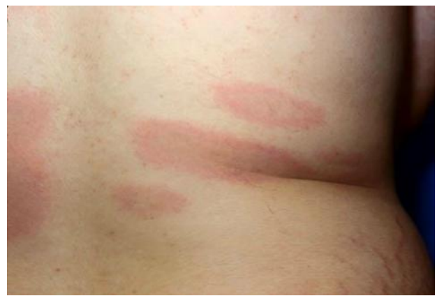
Above: Two presentations of “erythema migrans,” the rash associated with Lyme disease.