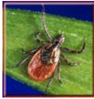
Blacklegged (deer) tick, magnified